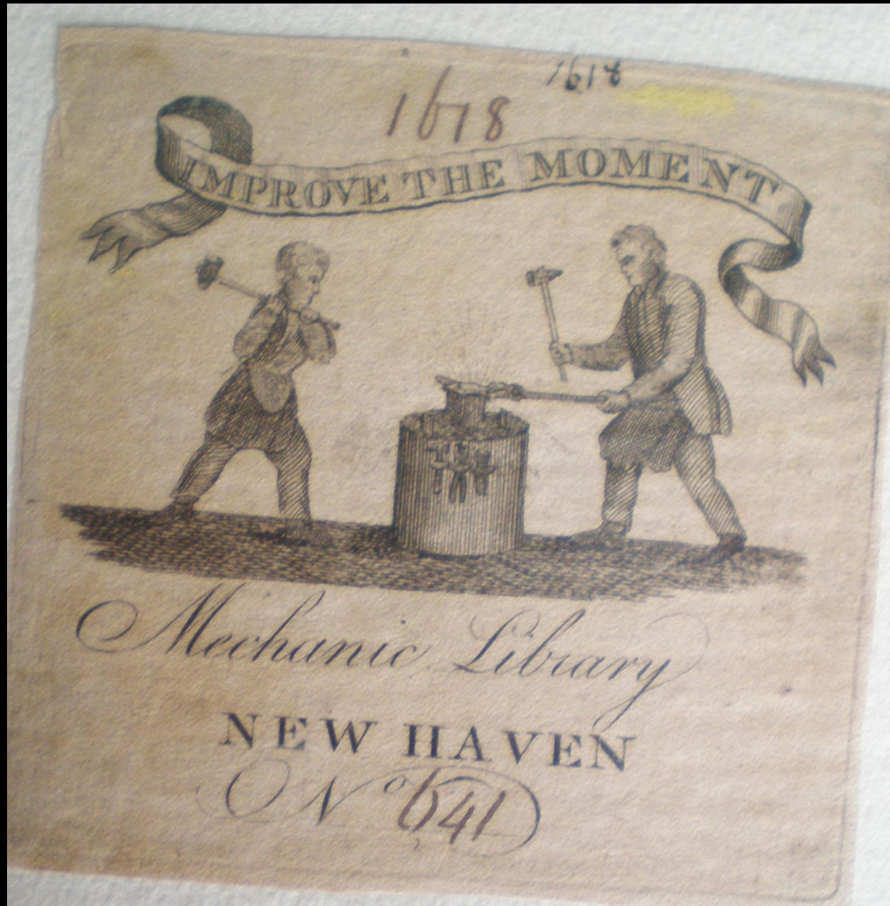
New Haven Mechanic Library Original Bookplate C. 1792