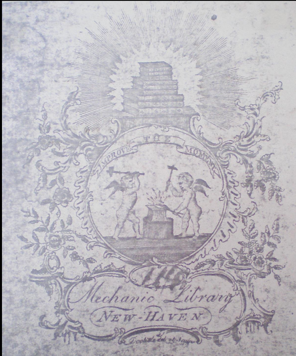
Bookplate from the Mechanic Library, New Haven c.1815 (Young Men's Institute)