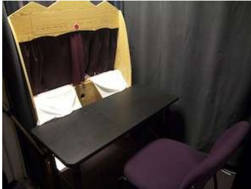
Figure 1. Study apparatus for preferential looking test and social-emotional interactions.