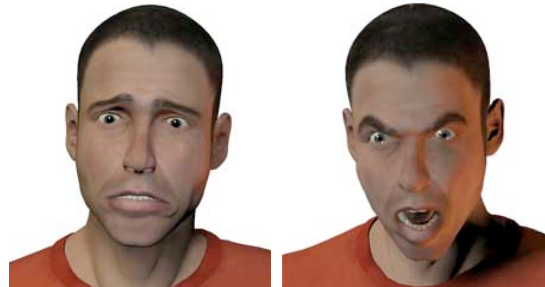
Scared (Fear/Wariness) | Surprise which could

The skin around your eyes is pulled in, and the eyes are tearing up (or even crying). Wrinkles are forming from the nostrils to the corners of your mouth.