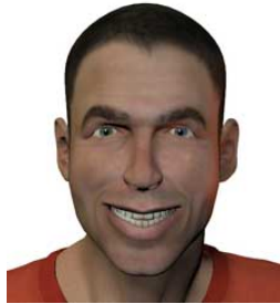
Joy / Happiness

Your forehead is relaxed – most likely it remains neutral. It could show light wrinkles if eyebrows are lightly raised.