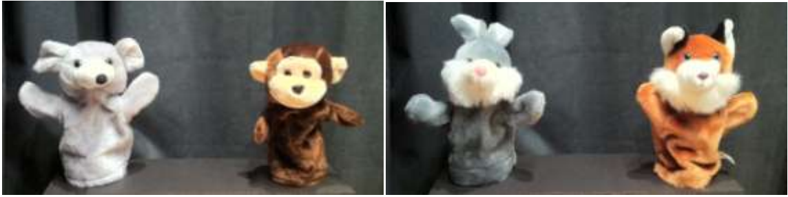
Figure 3. The four 10-inch hand puppets used in practice choice game (from left to right): gray mouse, brown monkey, gray bunny, brown fox.