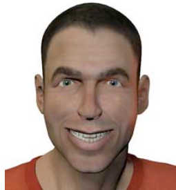
Joy / Happiness

Your forehead is relaxed – most likely it remains neutral. It could show light wrinkles if eyebrows are lightly raised.