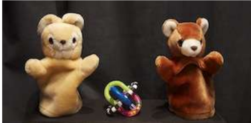
Figure 2. Study stimuli (from left to right): yellow bear (10 inch hand puppet), toy for interactions, brown bear (10 inch hand puppet).