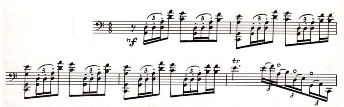
Example 47. Second Concerto for Violoncello , 3 rd movement, bar 4-8

The third movement is considered the best of the concerto. It mixes Brazilian ideas with Spanish dance, and requires instrumental virtuosity. The orchestra plays a brief introduction and the cello enters impressively using ricochet strokes playing its running triplets. The ample adoption of open strings creates bigger sonority and wilder atmosphere: