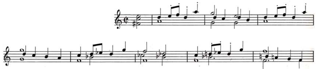
Example 12. First Cello Concerto , 2 nd movement, bar 4-12

This folk song is immediately followed by a theme first heard in the transition between the first and second movements. The use of triplets in this motif reminds this writer of the delightful theme in Tchaikovsky's Symphonie Pathétique .