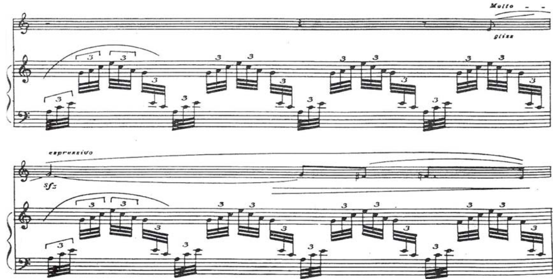
Table 3. Early cello works