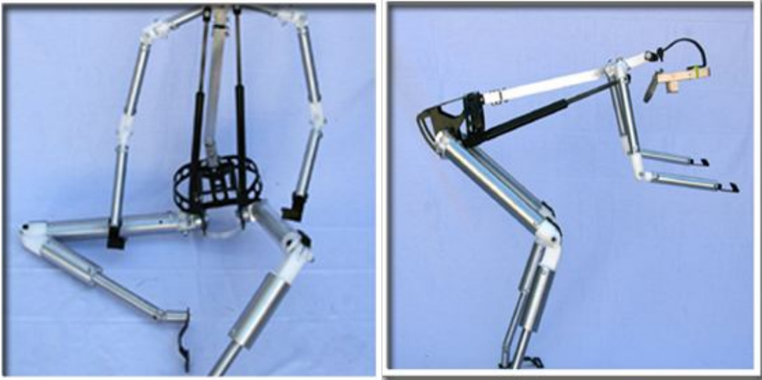
Figures 2 - 4 "Leeloo" My Party Doll