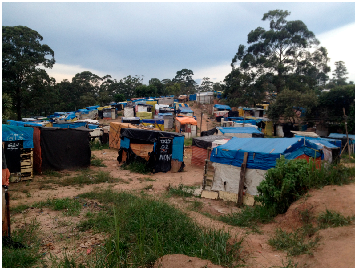
Figure 2. Partial view of MTST occupation Nova Palestina in the periphery of São Paulo.

As an example of the array of Brazilian social housing movements, the MTST had 23 land occupations in Greater São Paulo in 2016, with 50–60,000 people participating in them, according to members’ reports (see Figure 1). Just in the Nova Palestina occupation in the outskirts of São Paulo, MTST members claimed to have about 300,000 sq. mt. of land (see Figure 2). With these large land occupations, not only do they call the attention of other housing-poor people that end up joining the movement, they also force the attention of landowners and city officials that for whatever reason—often times greed, ideological opposition, and/or political indifference—had not been responsive to the movement’s demands. So, this is a sizable and symbolically powerful urban land grab by which the precariat is pushing for restorative justice as both a central process and outcome in the struggle for Brazil’s needed new urban land reform [38].