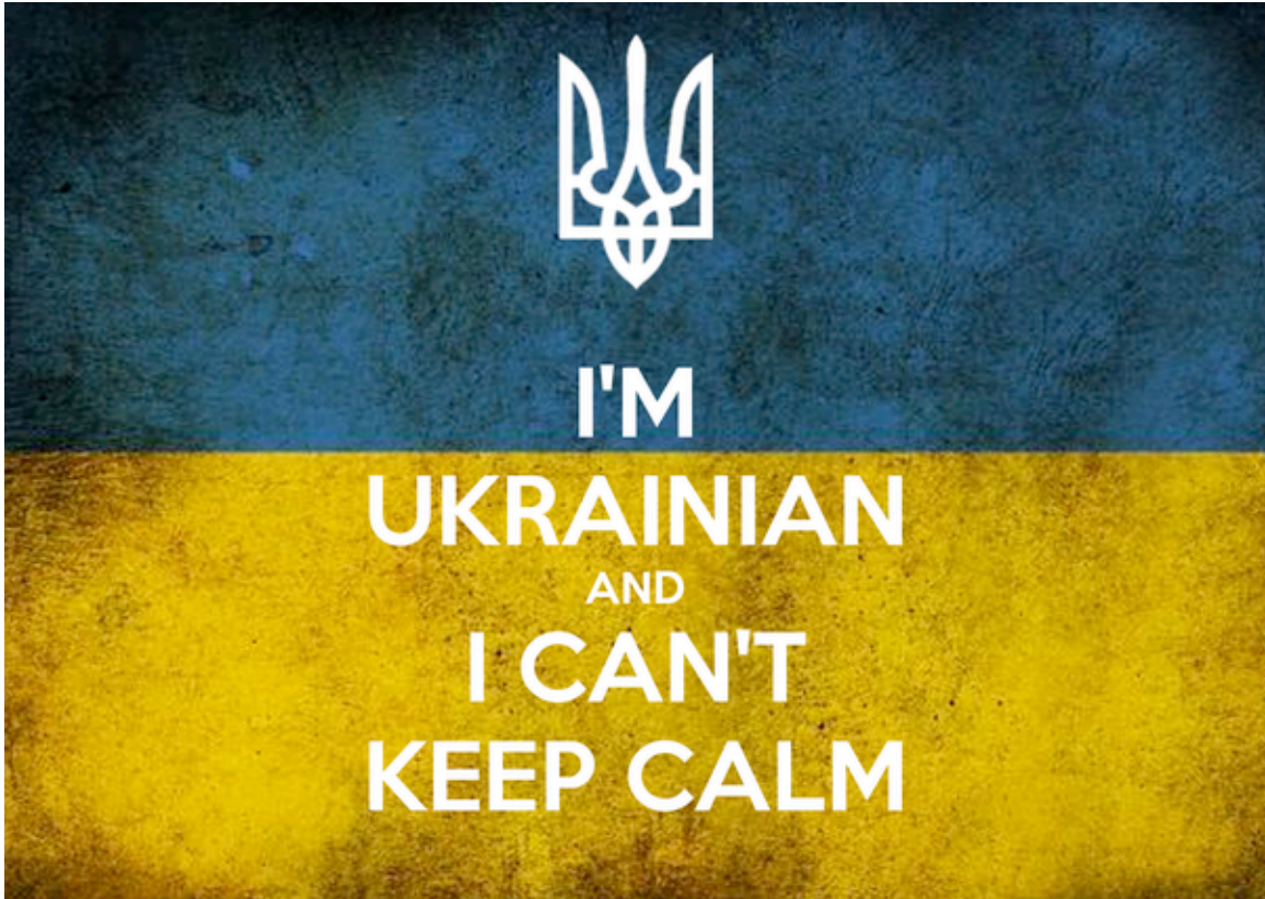
Figure 5. An example of the Euromaidan variation on the "Keep Calm" meme.

the same community.” The data journalist interviewed in Kyiv recalled that, during the more restless days of the protest, tweets on the #euromaidan hashtag reached into tens of thousands, and that “just to see the hashtag trend, and keep trending” on Twitter was meaningful and added to all the protest action on the ground, making it “more visible.”