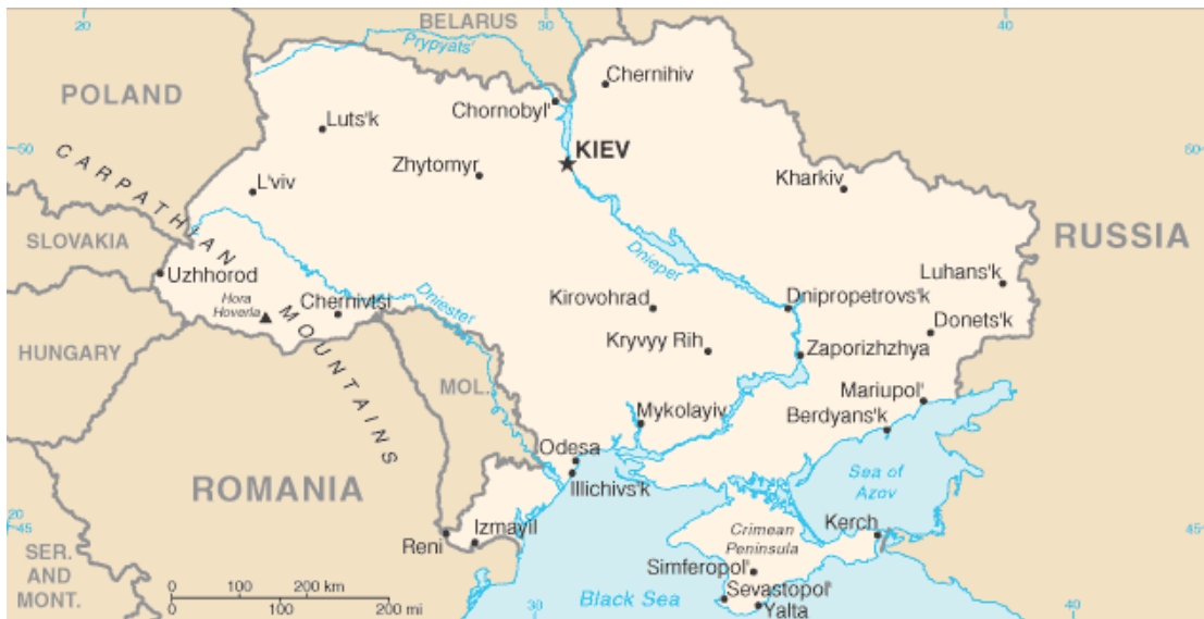
Figure 2. Map of modern Ukraine.

initially recruited from several key Euromaidan communities and groups, using their Facebook community pages to place recruitment ads, and then through snowball sampling stemming from the pilot interview wave participants, the third wave interviewees, and their networks. These interviews were conducted in Kyiv, the capital of Ukraine (and the epicenter of the Euromaidan protests); in Kharkiv, a large city in eastern Ukraine which saw some fairly active Euromaidan action during the protest; and in Odesa, a port city in the south of Ukraine that was also one of the key sites of Euromaidan action, though to a lesser extent than Kyiv and Kharkiv (see Figure 2 for a map of Ukraine). Of the 37 respondents interviewed, 16 were women and 21 were men.