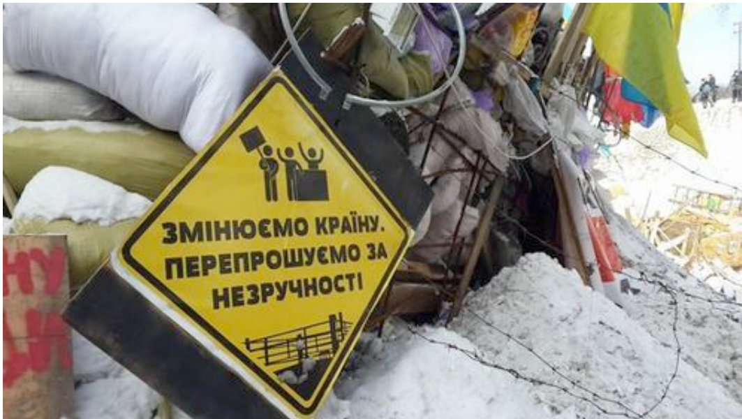
Figure 3. Photo of the "We're changing the country. We apologize for any inconveniences" sign in the Euromaidan protest camp in Kyiv.

Incidentally, a similar image appeared during the Occupy Wall Street protests, and was even spotted at the time of the 2011-2012 Winter of Discontent in Russia (Oates 2013), which provides some evidence in favor of not only tactical, but symbolic diffusion of a common visual protest language on a global scale.