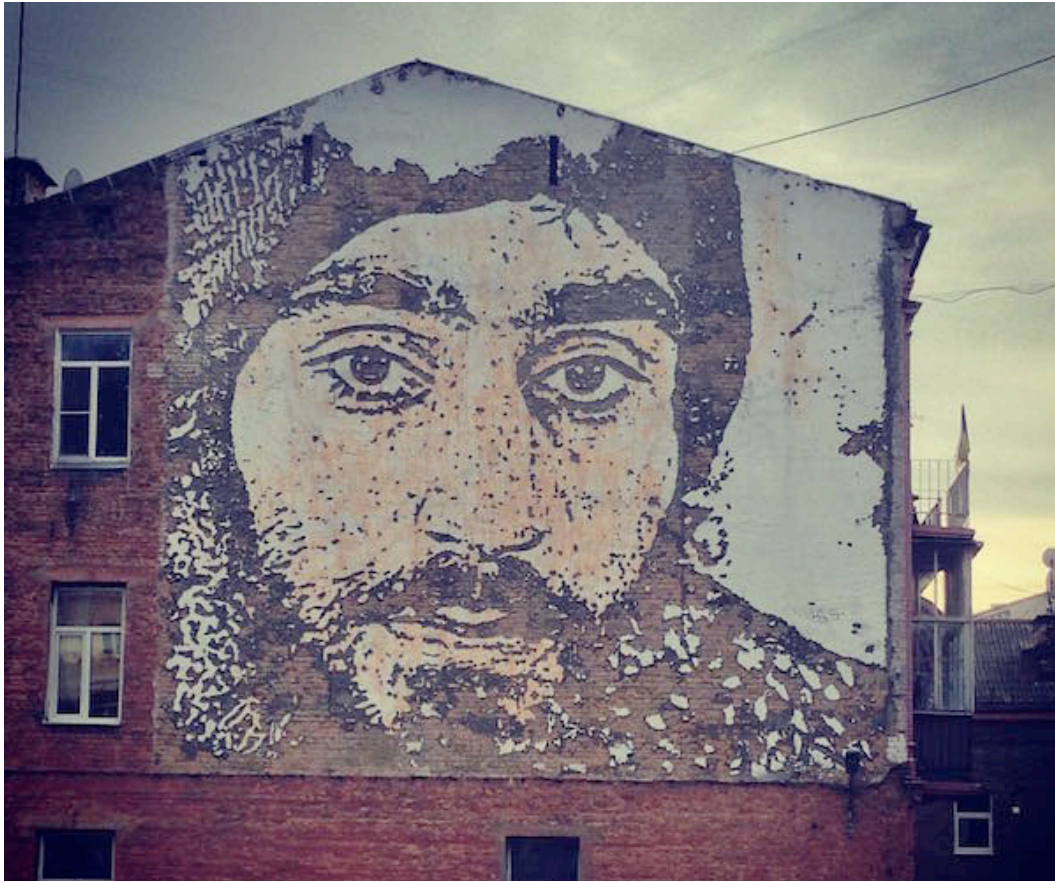
Figure 4. Mural depicting Serhiy Nigoyan, based on a popular photo, in downtown Kyiv. December 26, 2015.

Although the internet is now a highly visual medium (Andén-Papadopoulos 2008), enabled by greater speeds and optimization of digital content formats, the common “protest language” used by Euromaidan participants on social media went beyond visuals and extended the symbolic arsenal that helped create a sense of sharing a common space. Interview participants mentioned several things as having symbolic meaning within the context of Euromaidan. Common hashtags, such as #euromaidan (the main protest hashtag in Ukrainian, Russian, and English), #euromaidan_sos (calls for legal help or offers of help), #helpmaidan, etc., not only served an aggregating purpose, making it more convenient to find relevant information about the protest or follow the events in real time on Twitter and Facebook, but also provided a striking, dynamic symbol of the “sheer amount of people all engaged in