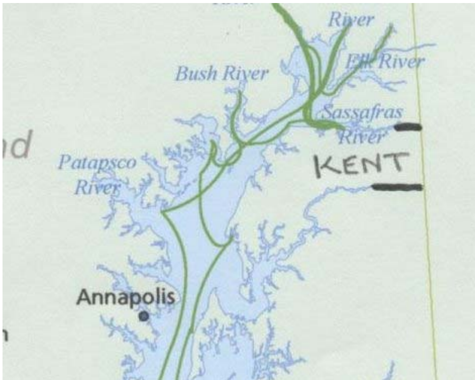
Figure 1.2, close-up of NPS map highlighting Kent County on the Eastern Shore of Maryland and Captain John Smith's voyage into the Sassafras River.